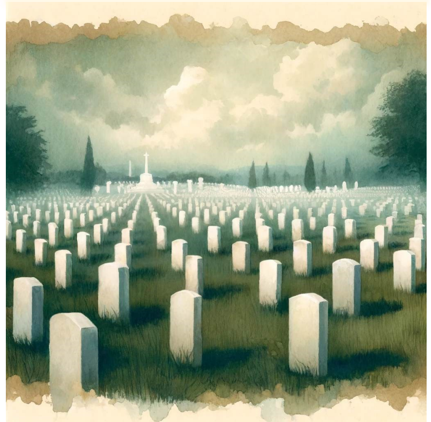
Fields of Honor

Fields of white stones, each a silent tale, Flags flutter softly in the mourning gale. Honor their memory, sacrifices cast, In quiet gratitude, forever vast.